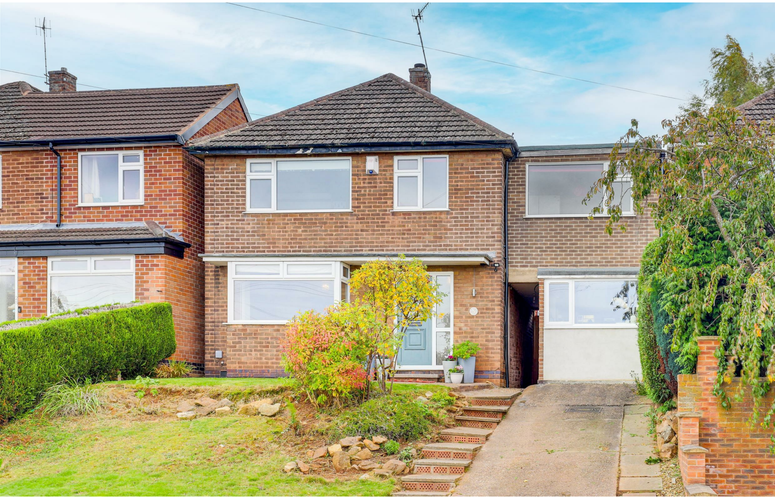
Whitby Crescent, Woodthorpe, Nottinghamshire NG5 4LY